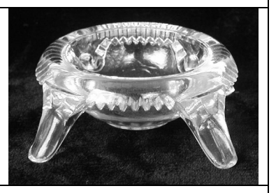
NEWCASTLE (SPRADDLE LEGS)